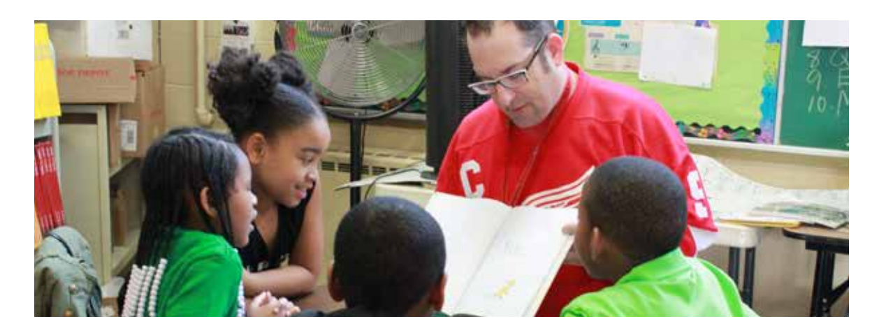
ALL STUDENTS. ALL FAMILIES. ALL COMMUNITIES. ALL THE TIME.